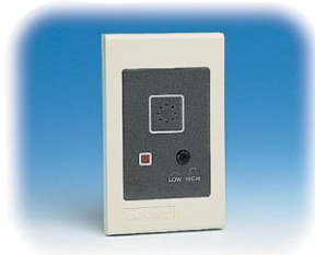
Duty Tone Station