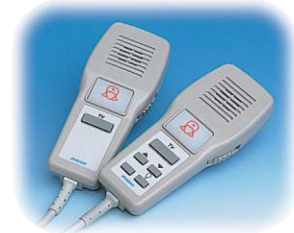
Choice of Pillow Speakers