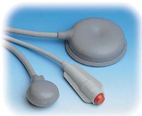
Choice of Call Cords