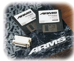
ARMS Reporting Software