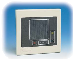
Single Call Cord Station

website: www.dukane.com e-mail: csdmarketing@dukane.spx.com