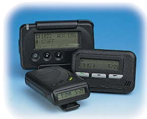
Pocket Page Integration