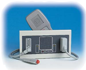
Dual Pillow Speaker Station